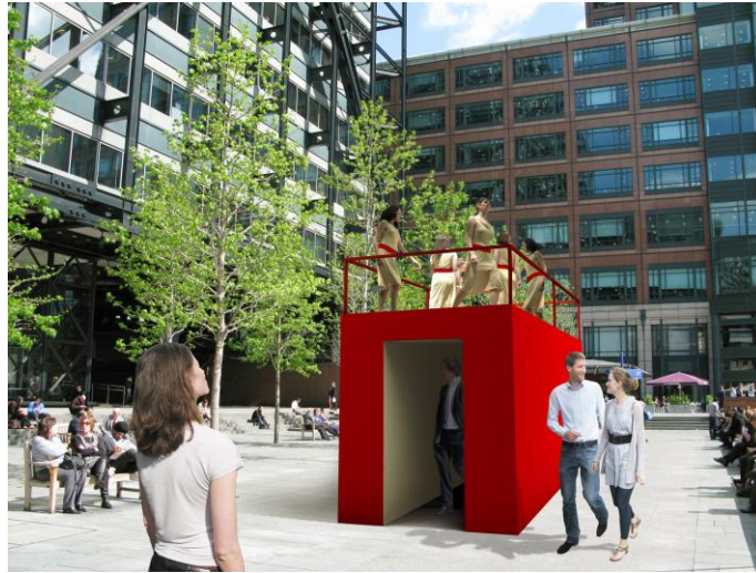
Kate Gilmore: Walk the Line , Exchange Square, London, 2011

Parasol unit foundation for contemporary art presents Walk the Line , a dynamic new site-specific sculptural artwork by the American artist Kate Gilmore on Exchange Square, London. Inaugurating a new strand of events, entitled Parasol Public , this public art project promises to be one of the most thrilling summer events in London. The event will be broadcasted live on www.parasol-unit.org .